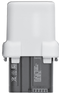
Extended Life Battery with Shuttle