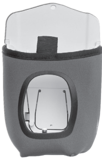
PowerShell with Neoprene Sleeve